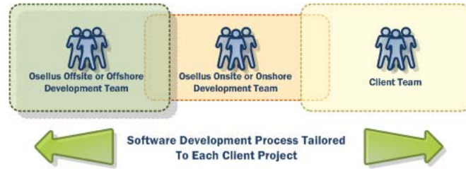
Osellus Delivery Model

At the start of each engagement, we commit a Toronto-based Project Manager to serve as a single point of accountability while managing the development process.